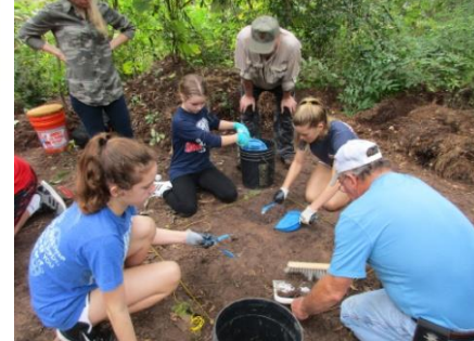
HAS members instructing students