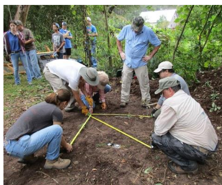
The team lays out a unit