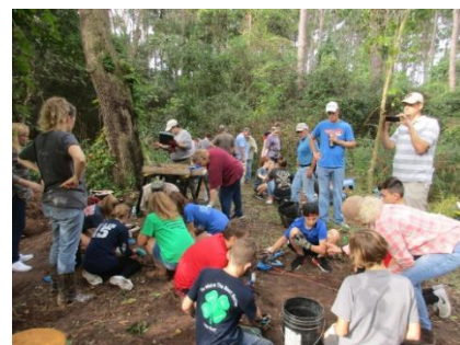
Rosehill kids working like real archeologists!!