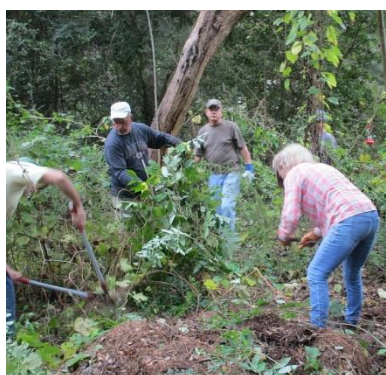
Clearing the area before digging