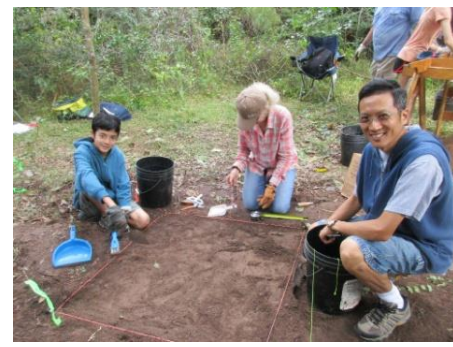
Rosehill parents got involved too!